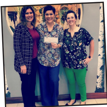
November, 2018 - Mt. Pleasant Staff dropping off the donation to Isabella County Child Advocacy Center