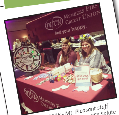
April, 2018 - Mt. Pleasant staff working the booth at the CFX Salute to Working Women event