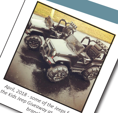
April, 2018 - some of the Jeeps from the Kids Jeep Giveaway at each of the branches