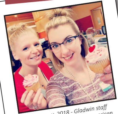
February, 2018 - Gladwin staff showing support for the American Heart Association