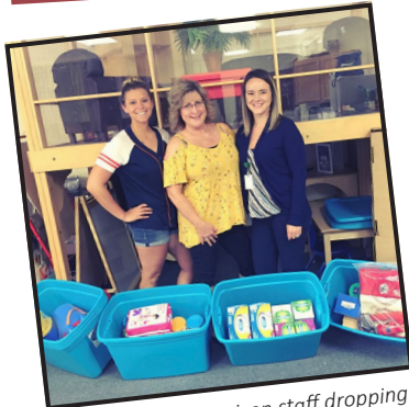
August, 2018 - Harrison staff dropping off donations to the NEMSCA Headstart in Marion