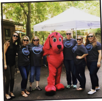
August, 2018 - staff volunteering at WGVU Kids Day at the John Ball Zoo in Grand Rapids