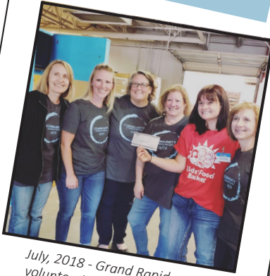
July, 2018 - Grand Rapids staff volunteering and dropping off donations to the Kids Food Basket