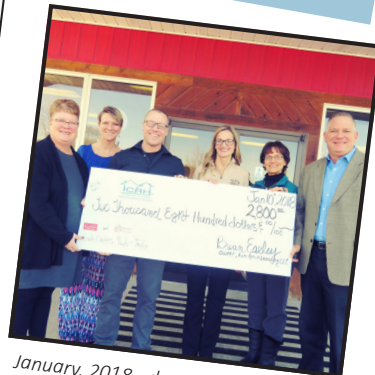
January, 2018 - donation for Isabella County Restoration House from the Auto Group Sale in Mt. Pleasant